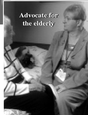
Advocate for the elderly

Protecting our air, water and land from dangerous pollutants.