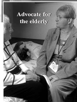
Advocate for the elderly

Fighting crime and protecting our communities.